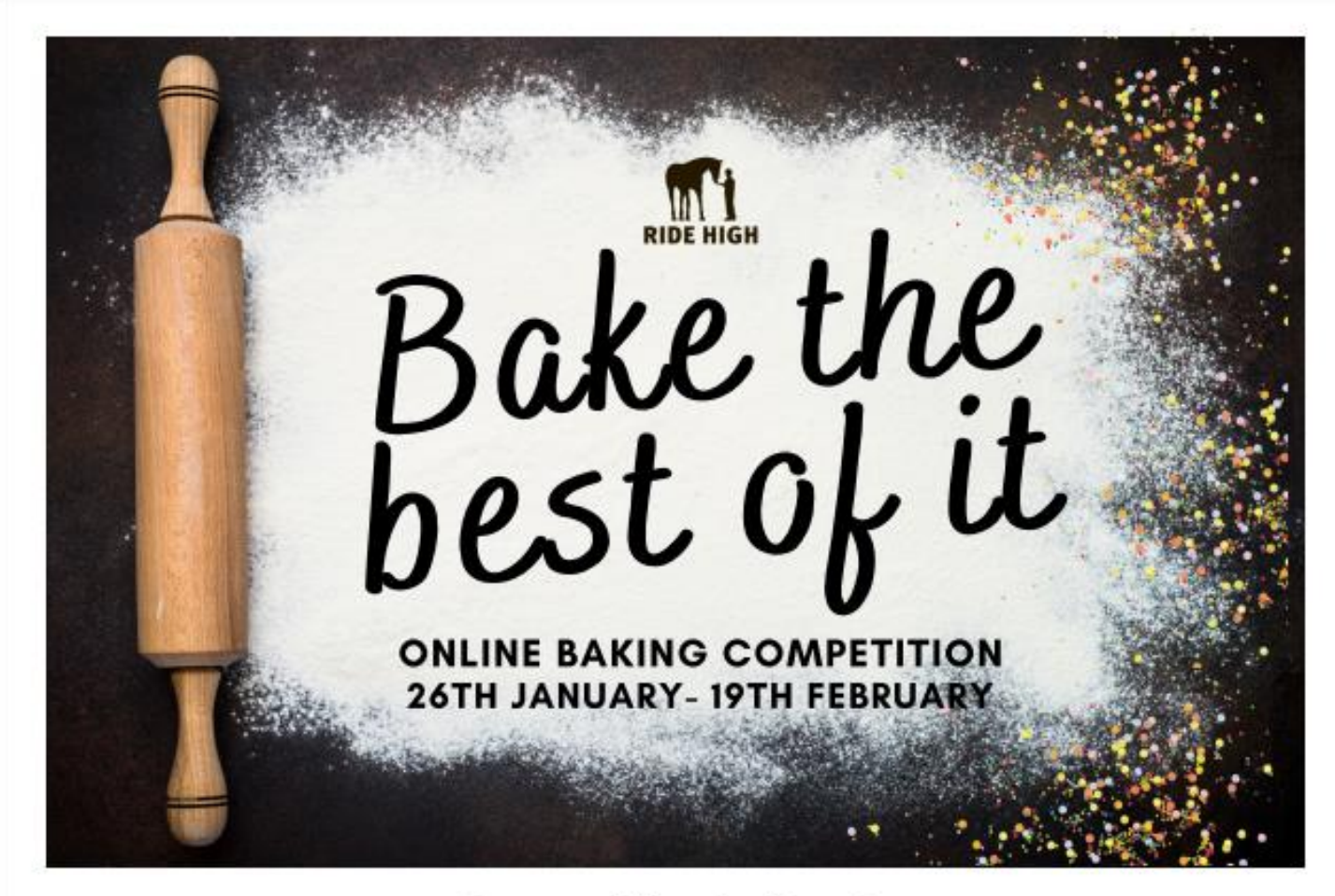
Do you like baking?

Ride High Baking Competition – Bake the best of it