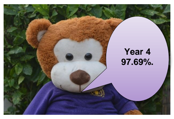
The House Point totals this week are...