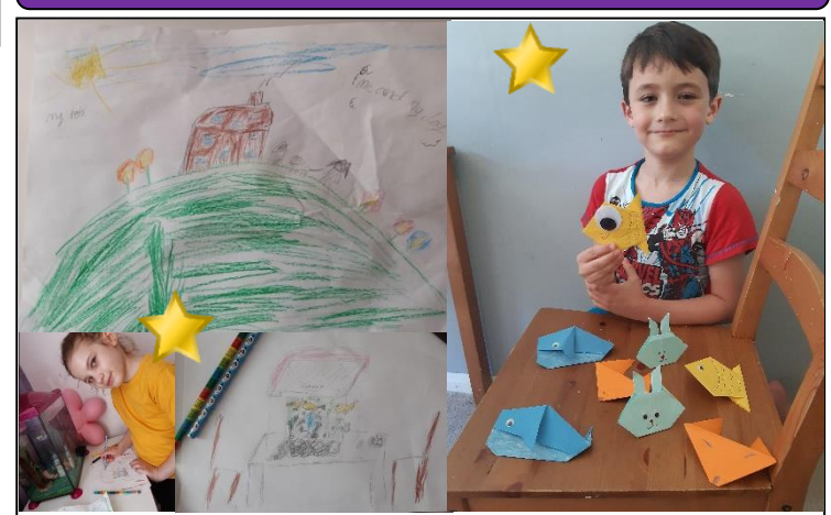
This animal artwork is amazing. We love it! Well done!

'Let your light shine before others that they may see your good deeds and glorify your Father in heaven.' Matthew 5:16