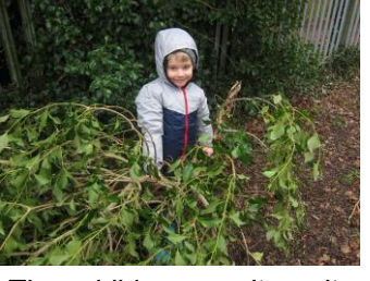
The children can't wait for Forest School again in five days' time.

Another highlight of the week is that Reception Class had their first experience of Forest School. They ventured out in their coats and wellies, to explore nature, experience the delights of